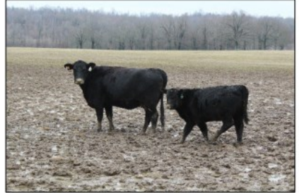
Figure 1. Excessive rainfall and high livestock concentration in and around hay feeding areas can result in almost complete disturbance.

Hoof damage from livestock during the winter months can result in almost complete disturbance of desired vegetation and soil structure in and around heavy use areas. Even well-designed hay feeding pads will have significant damage at the edges where animals enter and leave. Highly disturbed areas create perfect growing conditions for summer annual weeds like spiny pigweed and cocklebur. Weed growth is stimulated by lack of competition from a healthy and vigorous sod and the high fertility from the concentrated area of dung, urine, and rotting hay. The objective of this article is to describe two approaches to revegetating these areas.