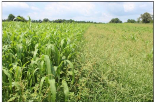
Figure 2. Sorghum-sudangrass (left) formed a quick canopy that was able to shade out summer annual weeds compared with forage (right).

tions on for individual summer annual species can be found in AGR-229, Warm Season Annual Grasses in Kentucky .